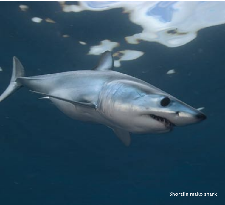
Shortfin mako shark

The scientists used several statistical techniques (including cluster analysis) to combine the individual results of all three approaches and estimate an overall risk of overfishing by pelagic fleets in the Atlantic for each pelagic shark species (Note—susceptibility to coastal fisheries was not incorporated into the expert group analysis and thus this method underestimates the risk for coastal pelagic sharks such as porbeagles and hammerheads. Crocodile sharks and smooth hammerheads were not analyzed