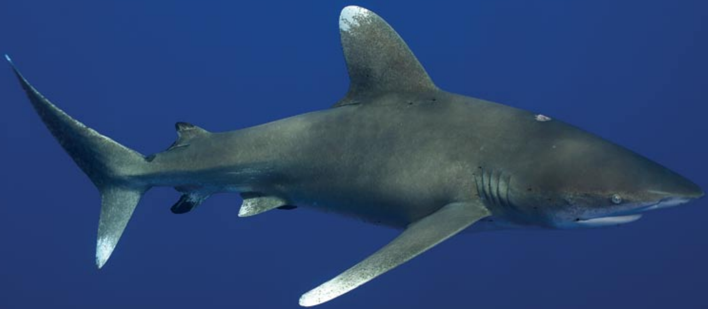
Oceanic whitetip shark

This study was funded by the Lenfest Ocean Program.