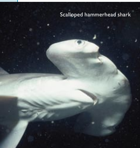
Scalloped hammerhead shark